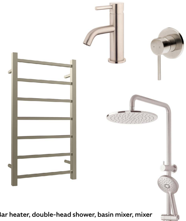
Bar heater, double-head shower, basin mixer, mixer