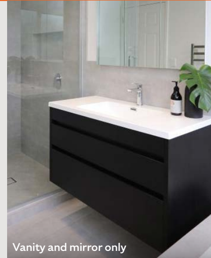
Vanity and mirror only