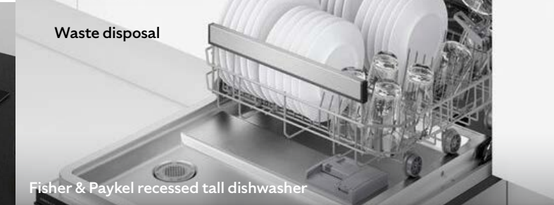
Fisher & Paykel recessed tall dishwasher