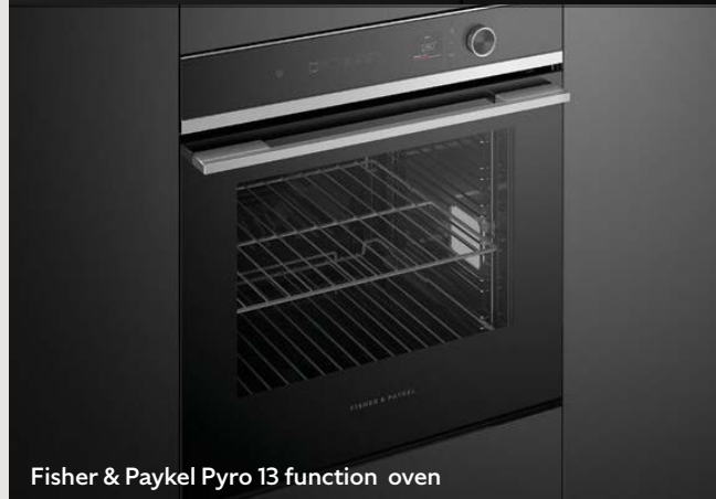
Fisher & Paykel Pyro 13 function oven