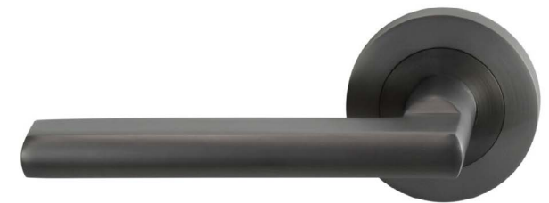
Door handles: Windsor Phoenix Galaxy in 'Brushed Nickel'