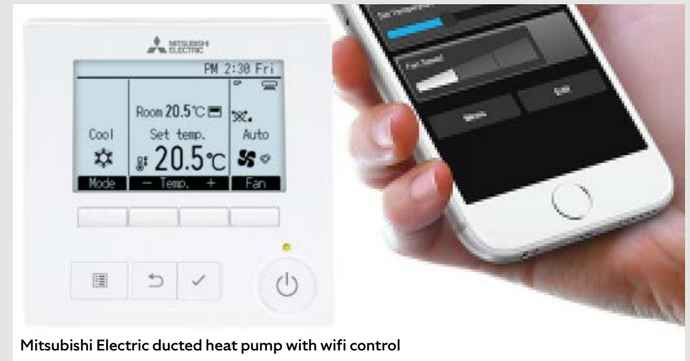
Mitsubishi Electric ducted heat pump with wifi control