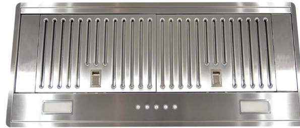
Ariston 70cm undermount rangehood