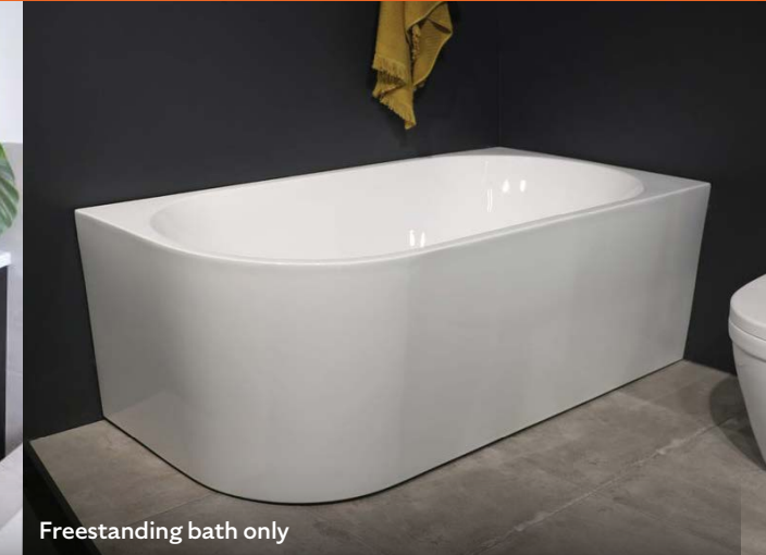
Freestanding bath only