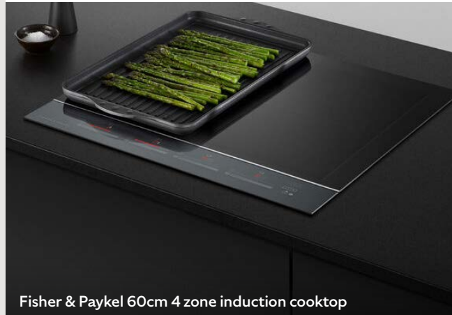
Fisher & Paykel 60cm 4 zone induction cooktop